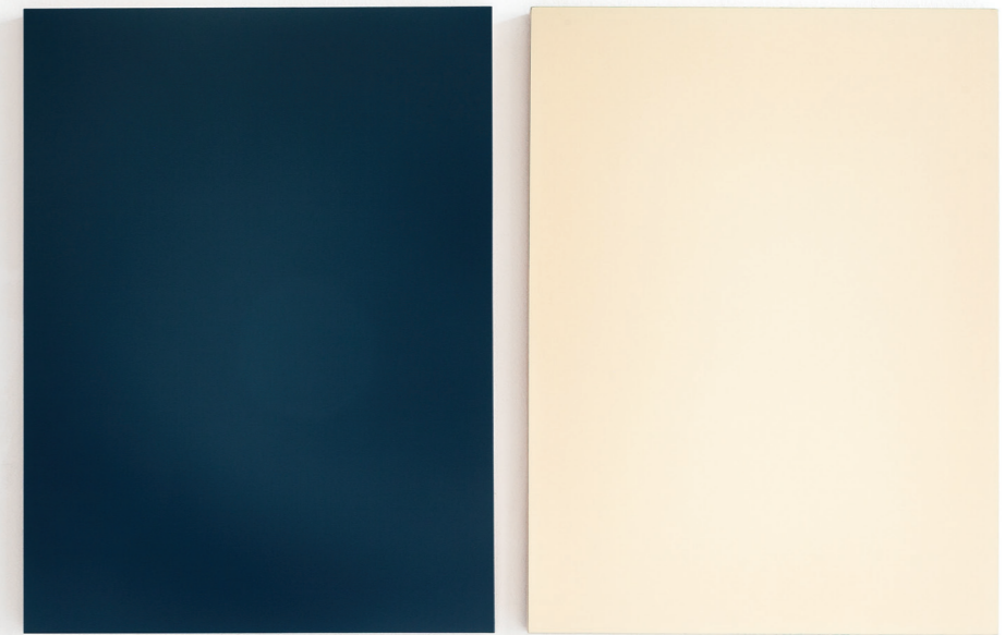
Untitled, 2017, Oil on Two Boards, 40.5 x 63cm, with split