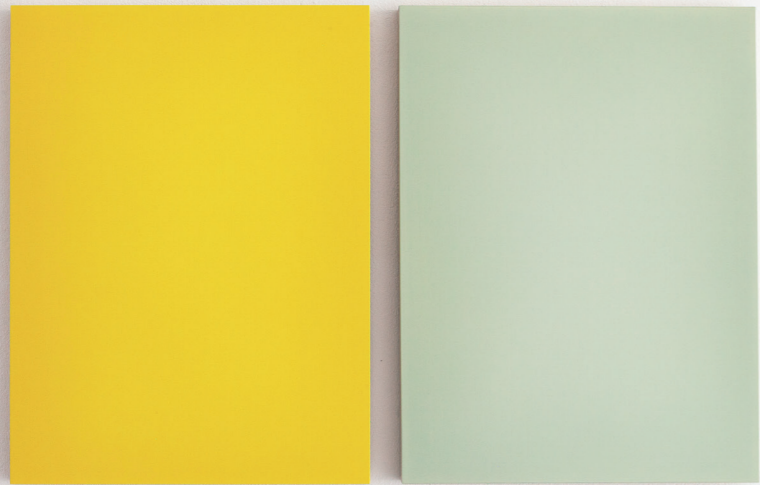
Untitled, 2017, Oil on Two Boards, 40.5 x 63cm, with split