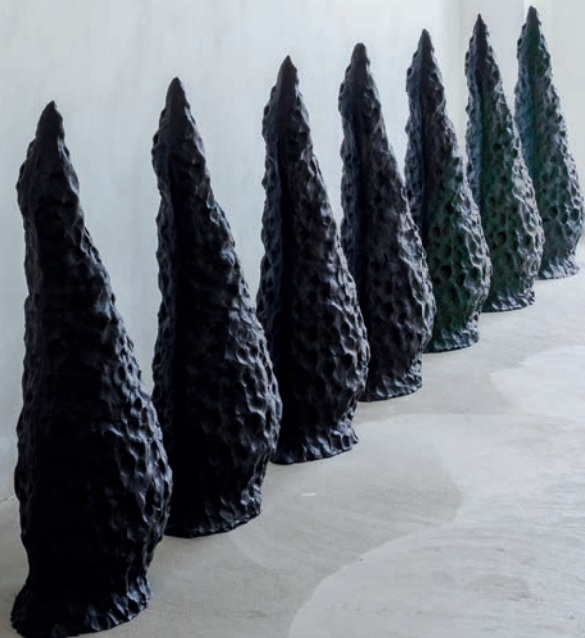
exhibition view: bedingt physisch, Gaps (2023), terrakotta painted