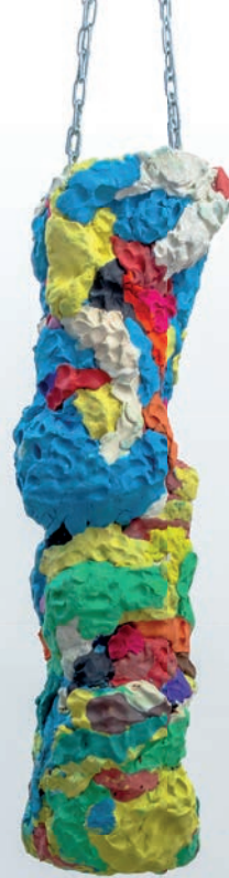
exhibition rules: bedingt physisch (from left to right), Vermessung 7 (2023), intarsia with inch rules / Bildhauer (2021), different colored plasticine

SF: This conditionally physical encounters between fleeting performance and physical (art) objects, after all, requires mutual trust and the – at least temporarily – renunciation of control over reception and interpretation. Is this something that you consciously pursue in your collaborations or is your personal artistic discourse at the forefront, which you make publicly visible?