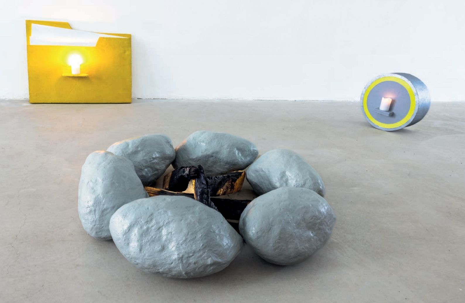
exhibition view: bedingt physisch (from left to right), Folder (2024), terrakotta painted, candle / Feuerstelle (2020), terrakotta painted / On/Off (2024), terrakotta painted, candle